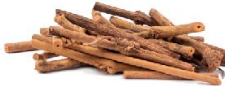
Natural Plant Dyes